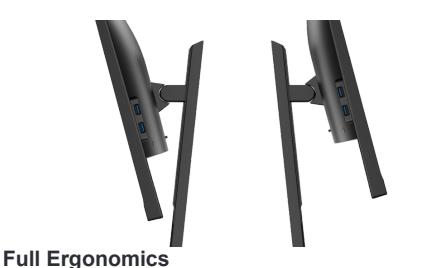
Feel the comfort! AOC's height, tilt and swiveladjustable stands help you find the most comfortable and healthy position.

IPS panel ensures an excellent viewing experience with lifelike yet brilliant and accurate colours. Colours look consistent no matter from which angle you look at the display