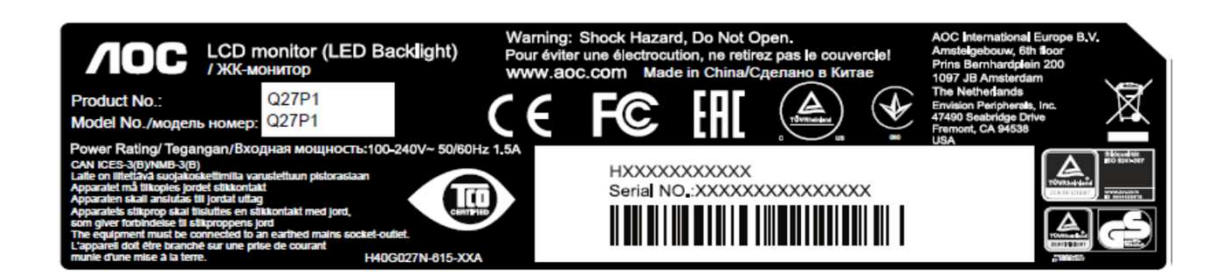
Illustration 2 - Marking Label